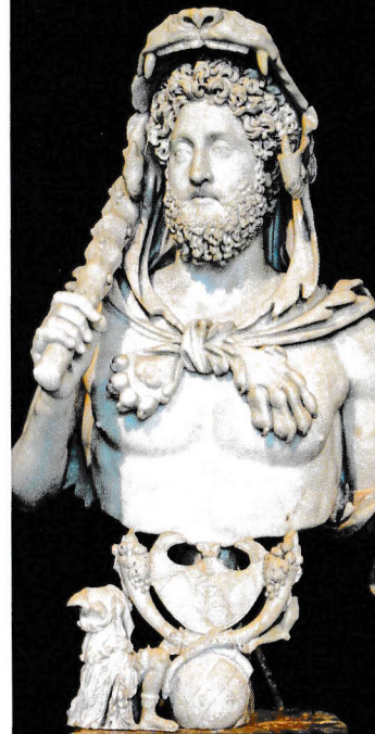
Commodus as Hercules A.D. 192 Capitoline Museum (Rome)