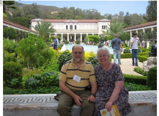
At the Getty Villa in Malibu