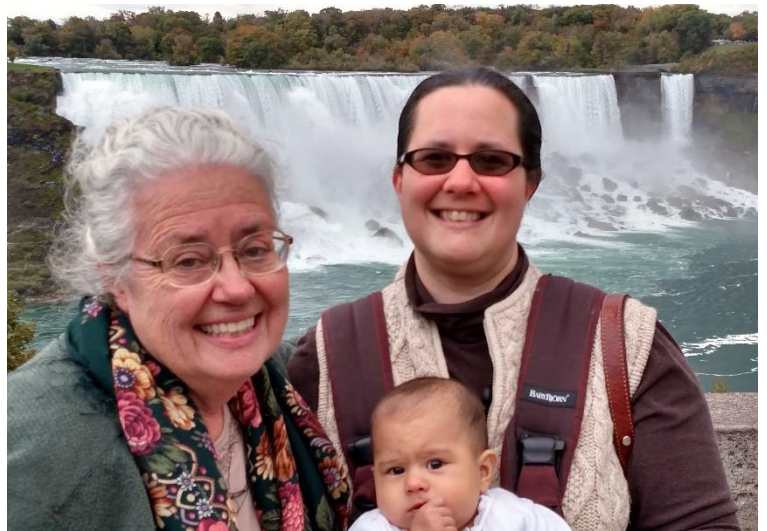
At Niagara Falls, October 2015