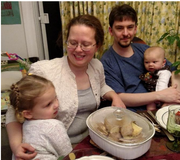
The Bond Family at Thanksgiving