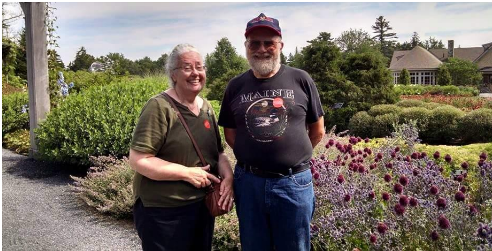
At the Coastal Maine Botanical Gardens, July 2015