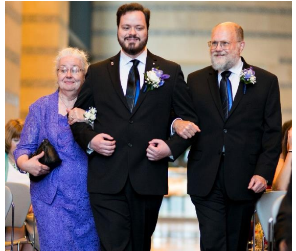
The Groom Escorts His Parents down the Aisle