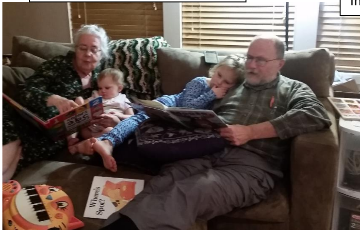
How We Spent Thanksgiving 2016