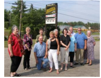
Waldoboro High School Class of 1968