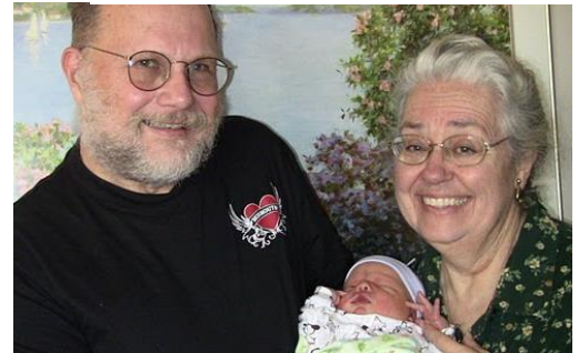
Proud New Grandparents