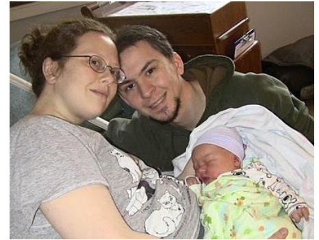
Proud New Parents