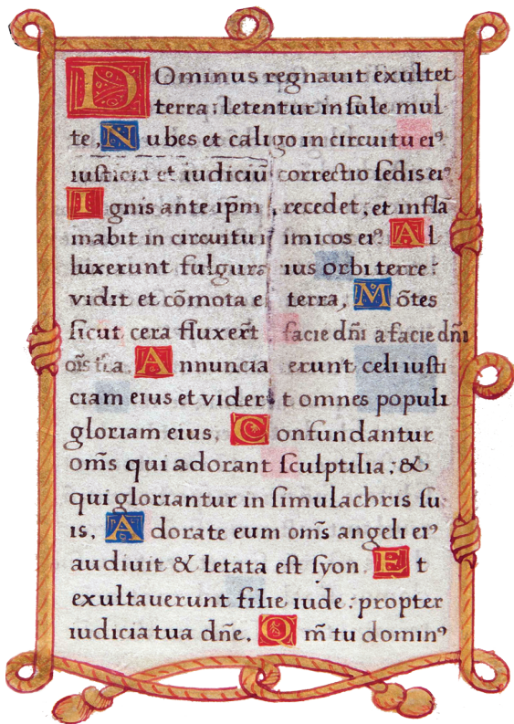
Decorated leaf from the Hours of the Blessed Virgin